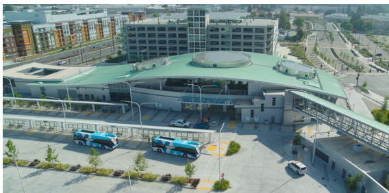
Milpitas Station (Looking East)