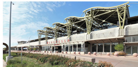
Berryessa Station (Looking West)