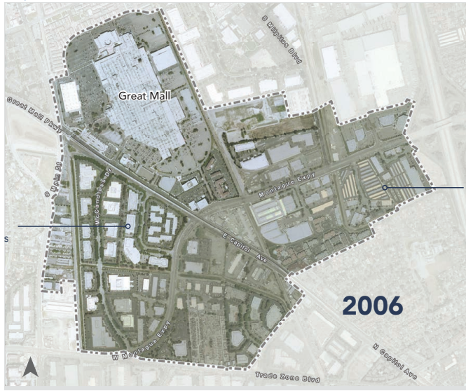
Milpitas Station Before (Aerial View)