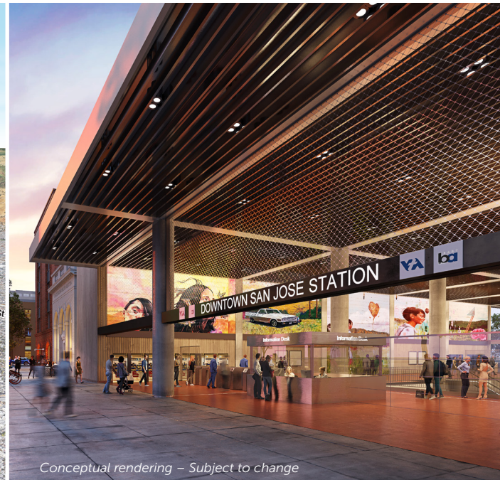
Conceptual rendering – Subject to change

Downtown San José Station will be on Santa Clara Street with the main station entrance between Market and 1st Streets and the secondary entrance between 1st and 2nd Streets. An emergency egress and ventilation facility will be at the northwest corner of 3rd Street. Ticketing and fare gates will be at street-level at both entrances while the station’s concourse and platform will be underground. There will be bicycle parking and convenient connections to VTA light rail and bus service on Santa Clara, 1st, and 2nd Streets. The station area will be integrated with planned on-site development, helping transition Downtown into a transit oriented community.