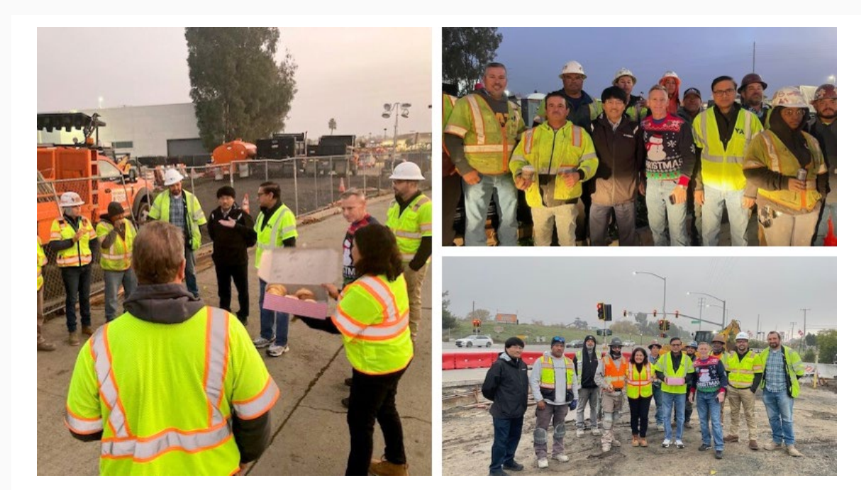
(Left to Right) - On a cold December morning, the EBRC team showed up at several construction areas, beginning at the south end of the project and working their way through the north end. [Photos by VS/LFP].

On Friday, December 20, construction staff and leadership visited crews along the 2.4-mile project to express sincere appreciation for their work. Donuts from World Donuts 'n Ice Cream at Crossroads Shopping Center and coffee from a Starbucks nearby were shared early morning as workers began their shifts. [Photos by VS/LFP].