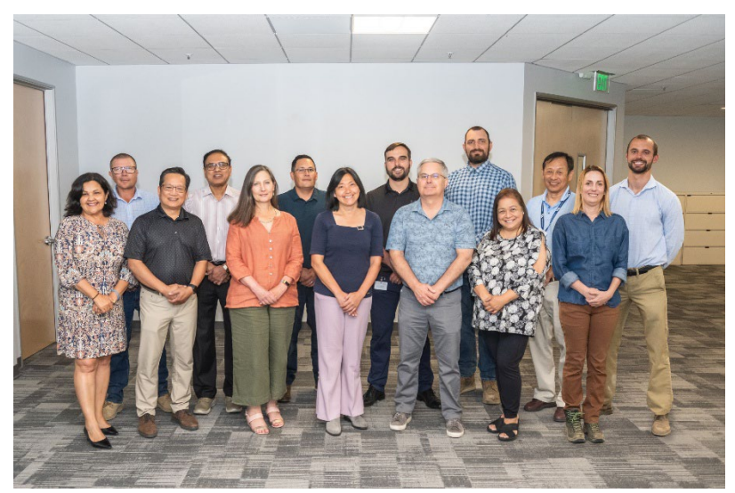
Moving Forward, The Construction and Engagement Team

Anticipated work through Sunday, February 2, 2025 (Partial List)