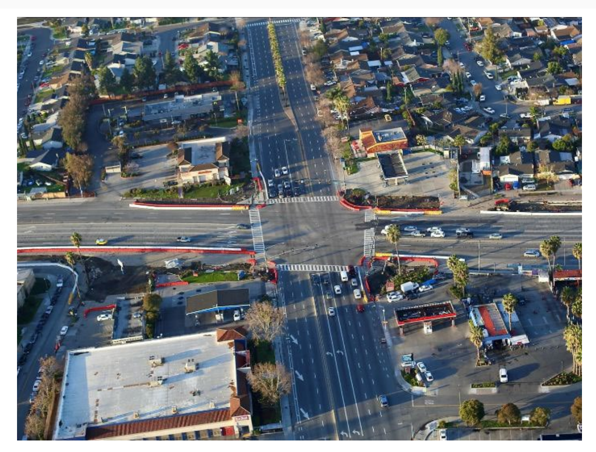
Aerial view of Story Road Intersection under construction with pedestrian paths next to orange barriers.