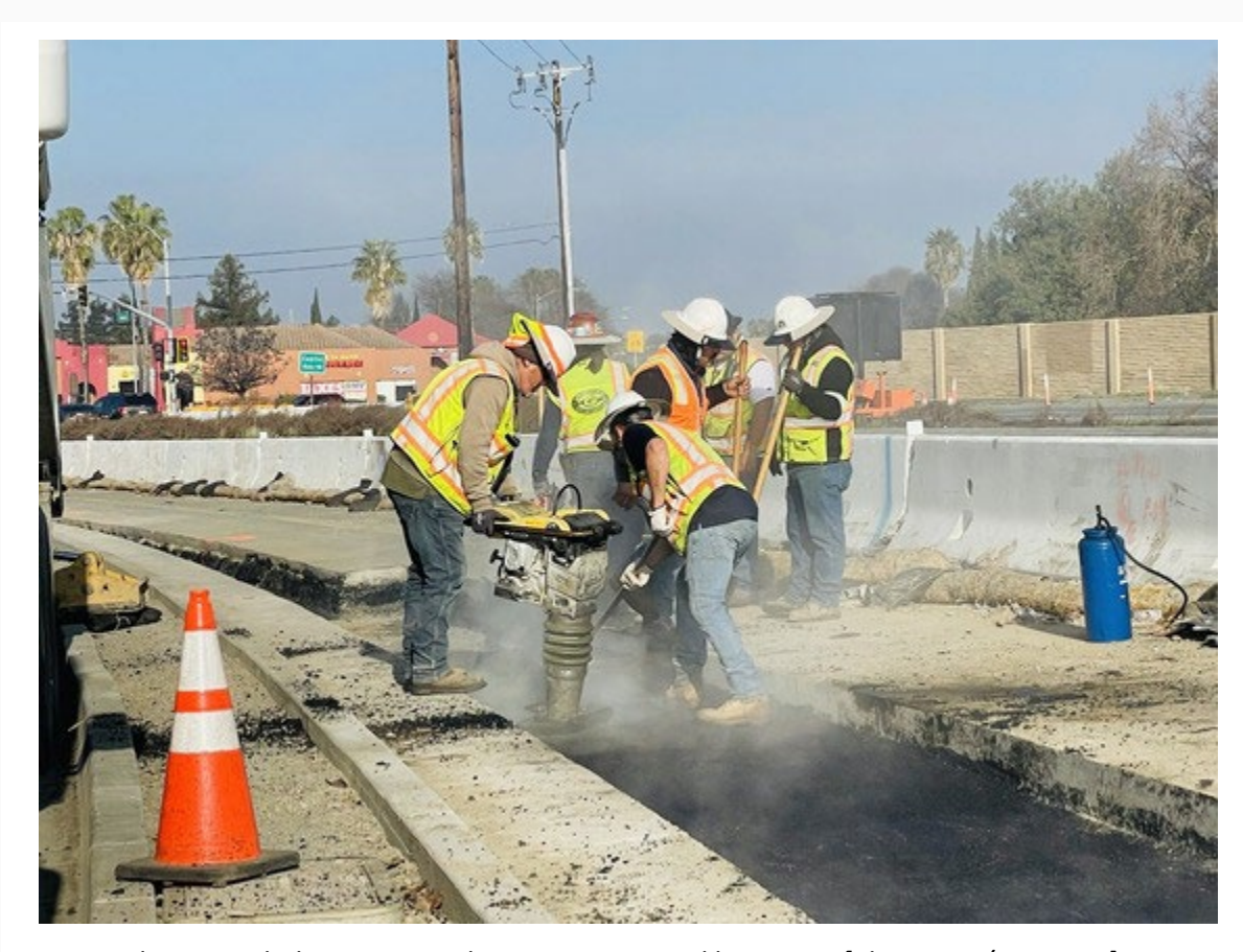
Crews placing asphalt on S. Capitol Avenue near Excalibur Drive.