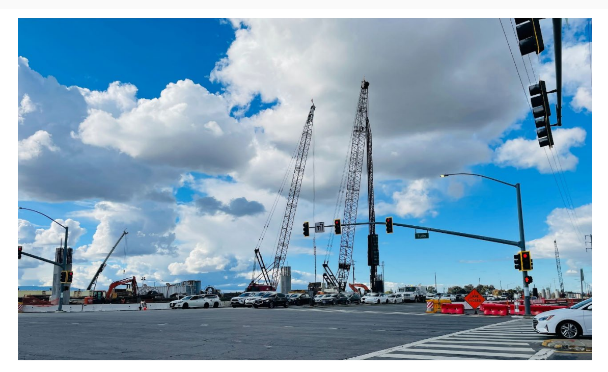
Cranes stand on the northwest corner of Capitol Expressway and Tully Road for sheet and pile driving to build the foundation/ columns that will support the guideway transition from the median to the west side of Capitol Expressway. [Photo VTA/EBRC LFP].