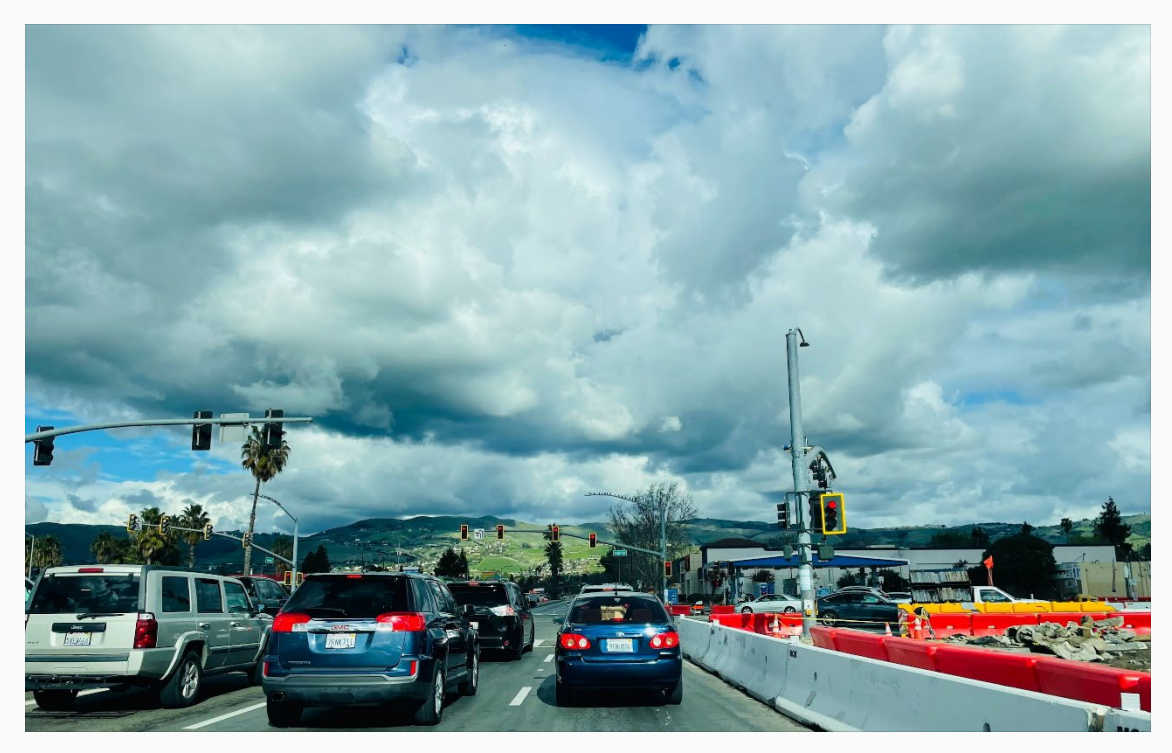
Community Outreach staff continue engaging with residents and business owners to ensure their concerns are addressed.

The Community Outreach Office has a new schedule: Tuesdays from 1:00 p.m. to 5:00 p.m. and by appointment. Staff is available weeklong to respond to the concerns of residents, business owners, and the community at large.