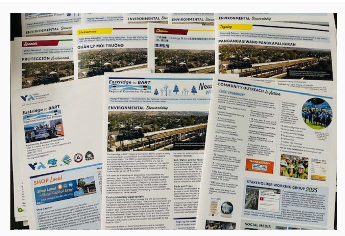
EBRC Winter Newsletter.

The EBRC Winter Newsletter was mailed to 14,000 residents and businesses near the project. This publication includes an article on environmental stewardship, an explanation of how the aerial light rail extension is built, and a summary of outreach activities for 2024. The newsletter is translated from English to Spanish, Vietnamese, Chinese, and Tagalog.