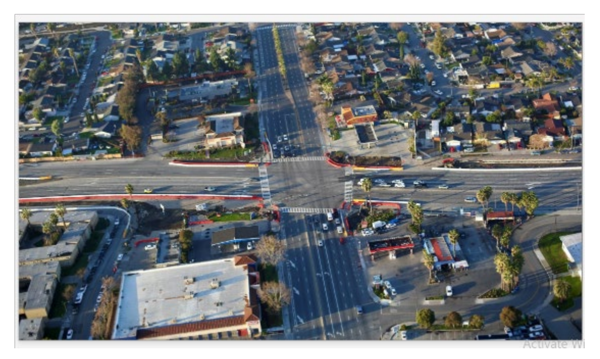
There will be changes to the Capitol Expressway and Story Road intersection this March, when traffic lanes will be shifted. As a result, the Expressway will have three lanes in each direction.