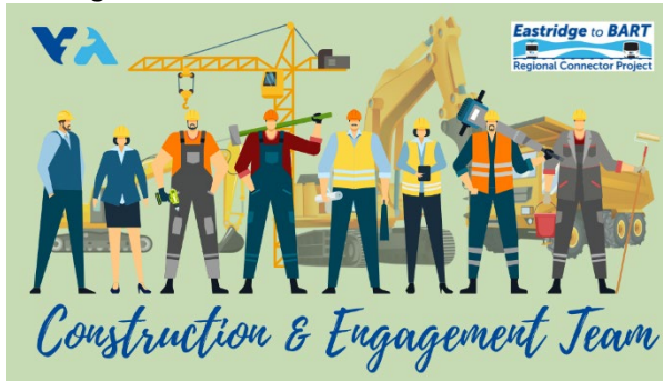
The Construction and Engagement Team