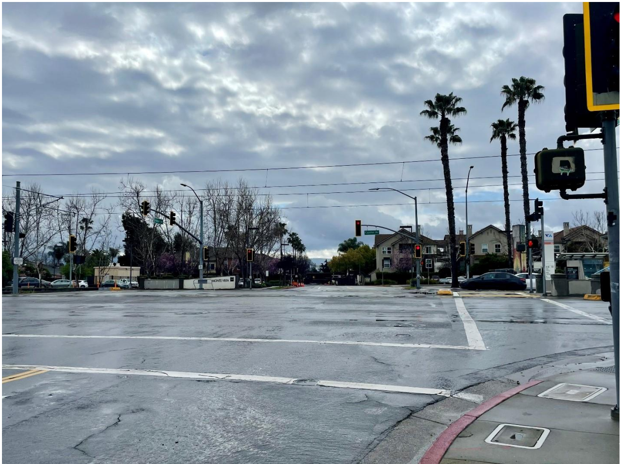
Capitol Avenue and Wilbur Avenue intersection. In the background, Montevista Apartments.

*Construction activities can change at any time at the contractor's discretion.