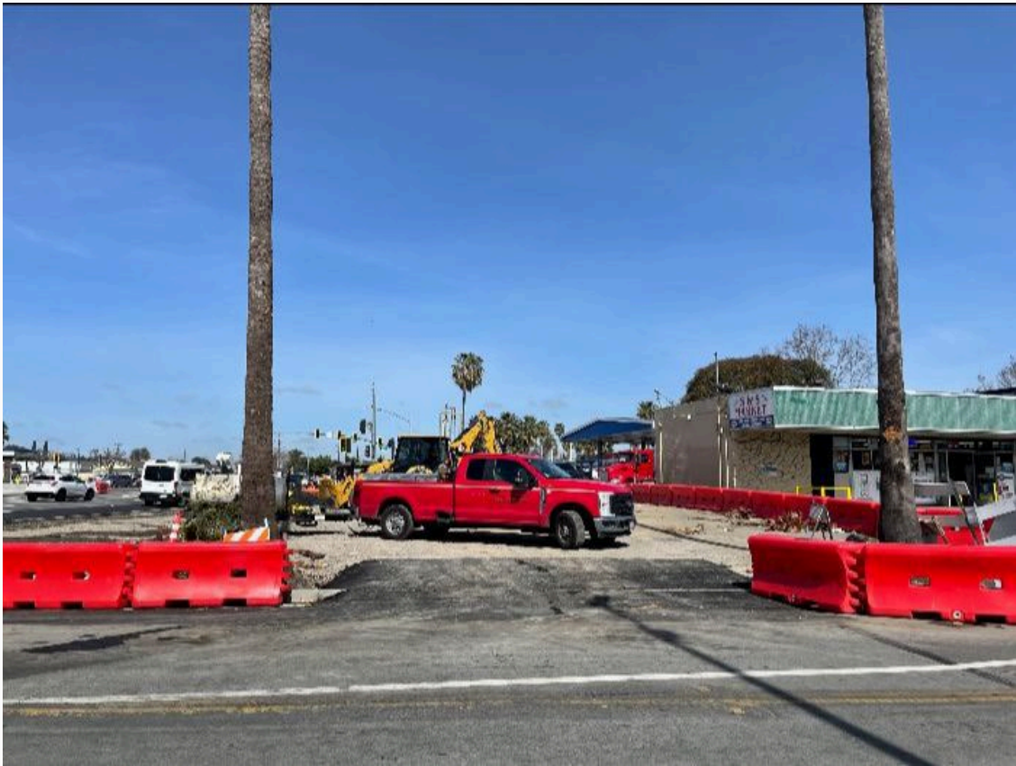
This property by S&S Market will be part of the VTA Story Road Station, but for now, it will be used as a temporary parking area for selected residents from the K&K Apartments while the 10-carport is replaced.

Staff continue communicating and coordinating activities impacting private property with residents, homeowners, and business owners near the project. The Community Outreach Office is open Tuesdays from 1:00 p.m. to 5:00 p.m. and by appointment. Our address is 1091 S. Capitol Avenue (near Story Road) in San Jose. Staff is available week-long to respond to the concerns of residents, business owners, and the community at large.