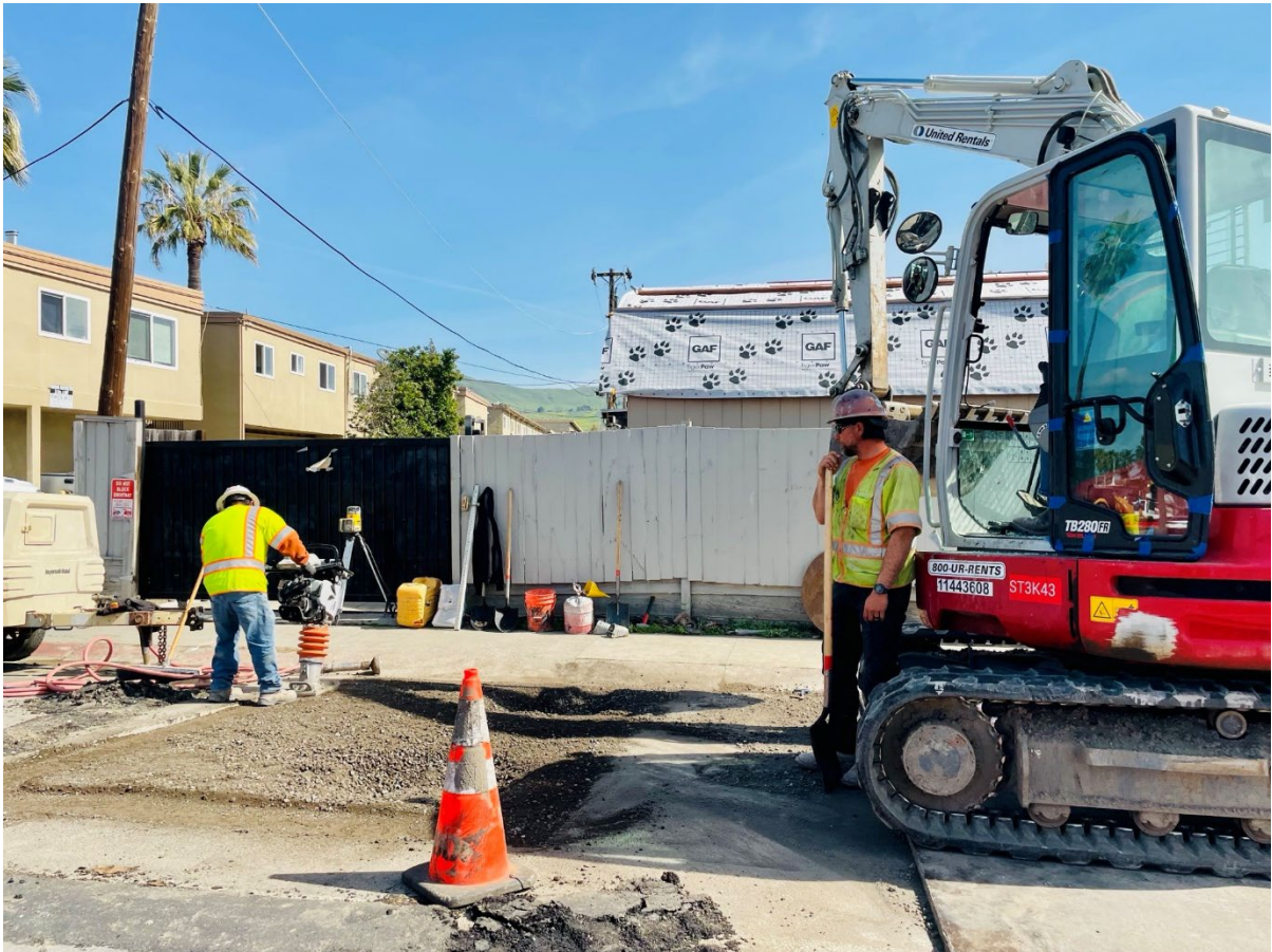
Drainage work on S. Capitol Avenue near Sussex Drive.