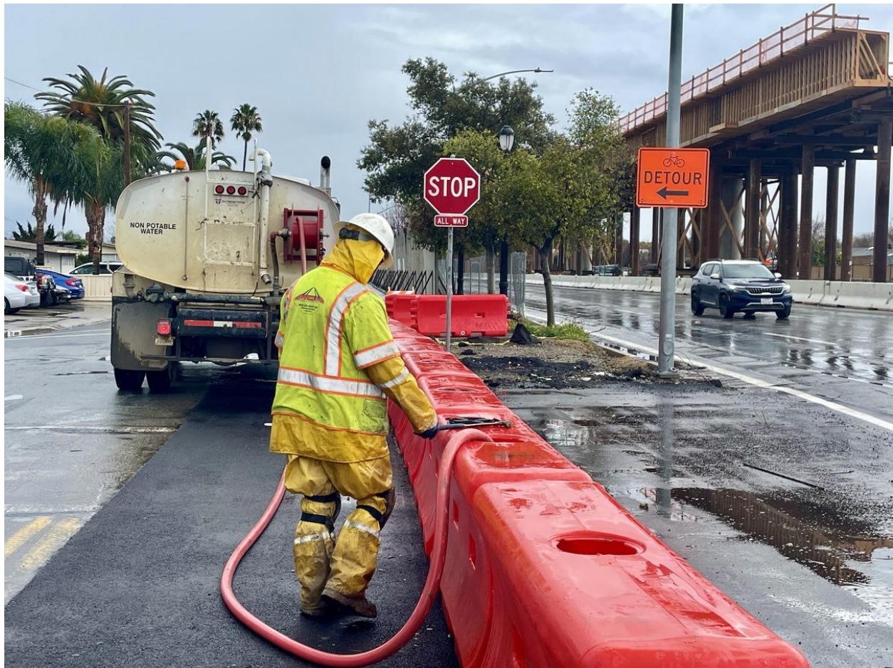
A construction worker pours water into a series of barriers installed in the east side of northbound Capitol Expressway. Water-filled barriers ensure safety due to their visibility. They help to control vehicle and pedestrian traffic.

The construction of the Eastridge to BART Regional Connector continues despite inclement weather and other conditions. Crews continue working day and night at different locations, from Capitol Avenue/Wilbur Avenue, where the project begins, to Capitol Expressway /Quimby Road, where the project ends.