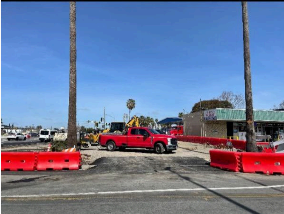
This property by S&S Market will be part of the VTA Story Road Station, but for now, it will be used as a temporary parking area for selected residents from the K&K Apartments while the 10-carport is replaced.

Staff continue communicating and coordinating activities impacting private property with residents, homeowners, and business owners near the project.