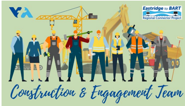
The Construction and Engagement Team